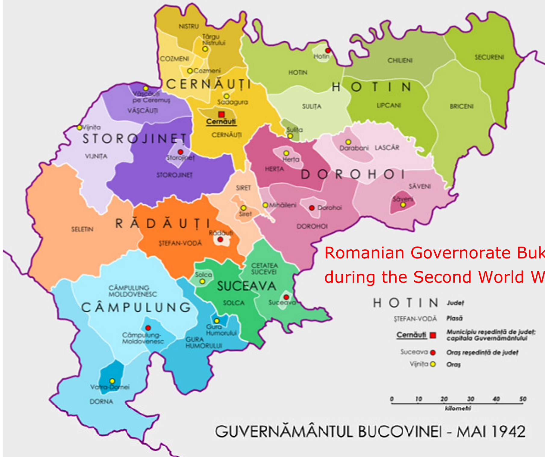
Romanian Governorate Bukovina during the Second World War