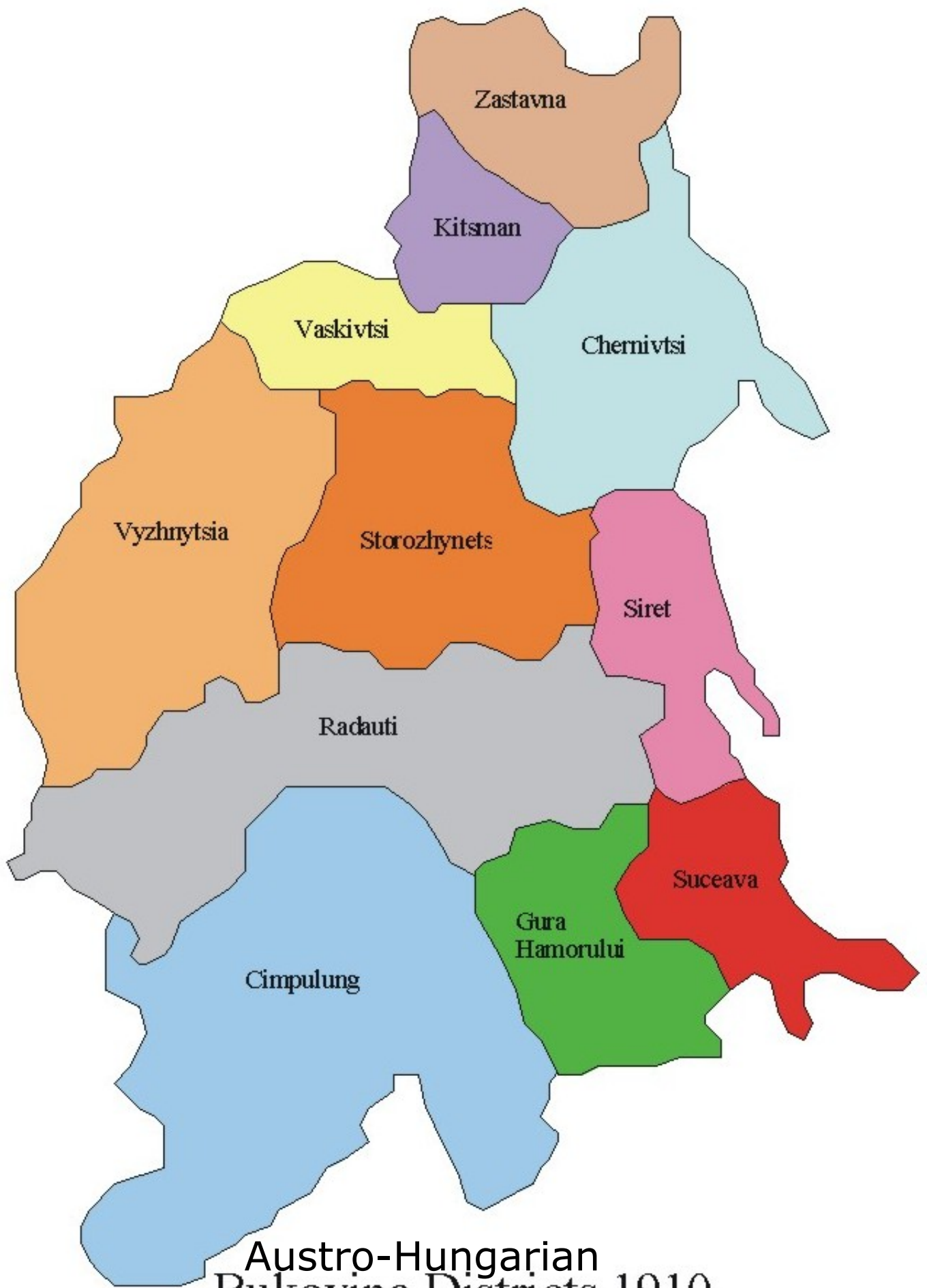
Austro-Hungarian Bukovina Districts 1910